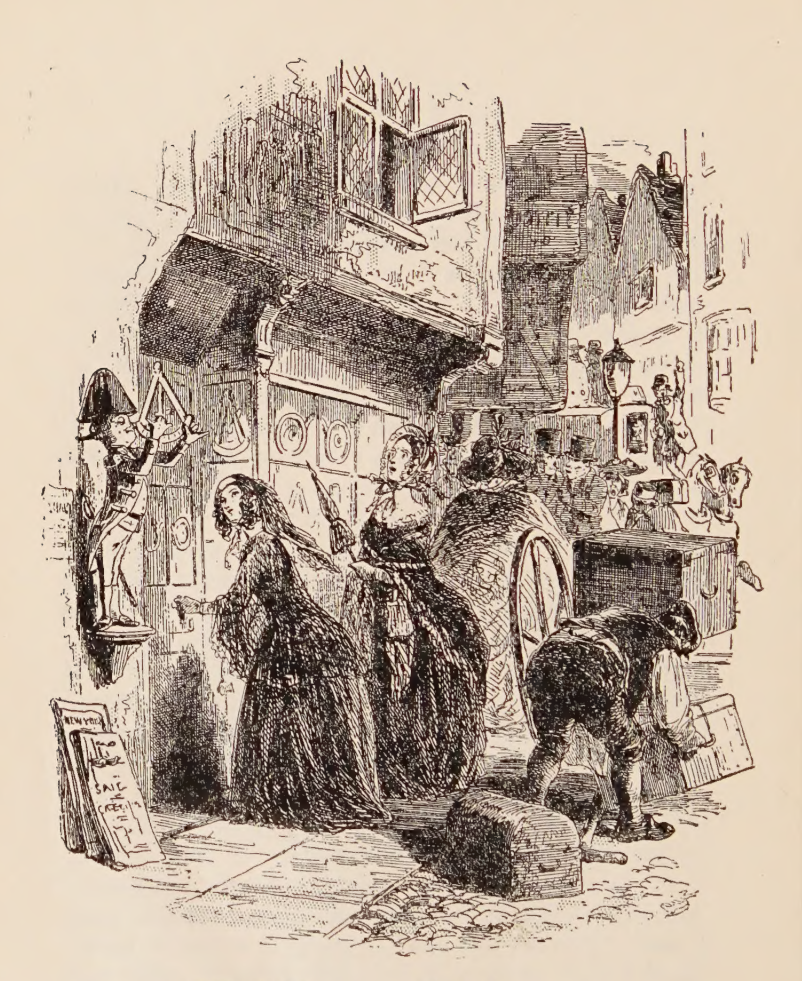
The Wooden Midshipman on the Look-out